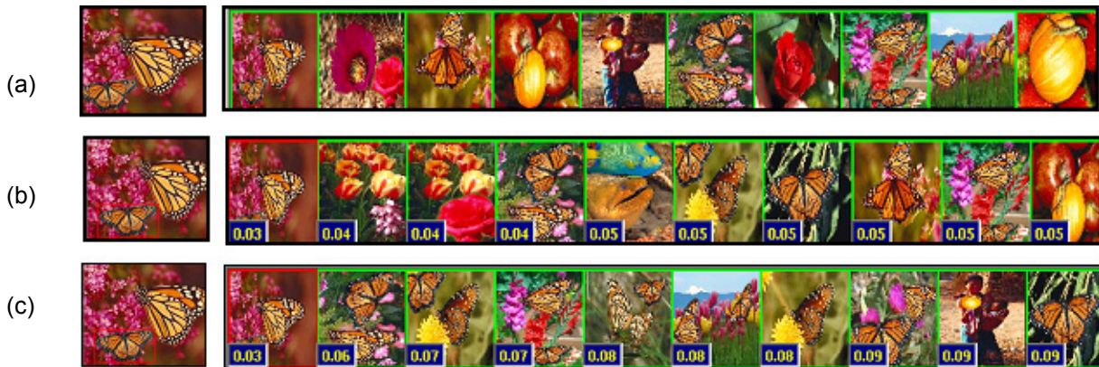
Figure 1. The retrieval results from different color features, (a) global histogram, (b) regional histogram, and (c) combined regional histogram and autocorrelogram.

As we can see from Fig. 1, the retrieval results of using combined regional color histogram and autocorrelogram are better than those of using global histogram and regional histogram only even in the case where the query ROI is in different scales, points of view, and background or partially appears in the indexing images. This is due to the color distribution and color structure information supported by the combined feature.