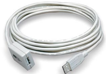
PDQ12, USB-powered extender cable