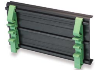
PDQ10, DIN-rail mounting adapter