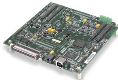
DaqBoard/3000USB, 16-bit/1-MHz USB data acquisition board