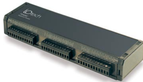
PDQ30, analog input expansion module