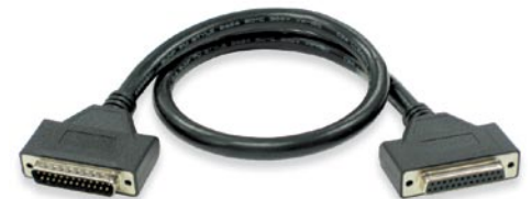
CA-96A, Personal Daq/3000 to PDQ30 cable

Note: For OEM and embedded applications, see DaqBoard/3000 USB.