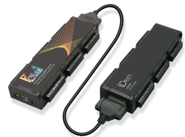
Personal Daq/3000 attached to a PDQ30 expansion module via a CA-96A cable