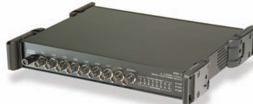
The WBK18 provides a full set of features for making dynamic signal measurements