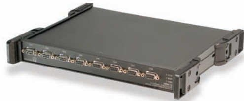
The WBK16 provides eight channels of strain gage input