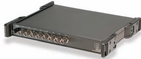
The WBK10A adds eight differential analog inputs