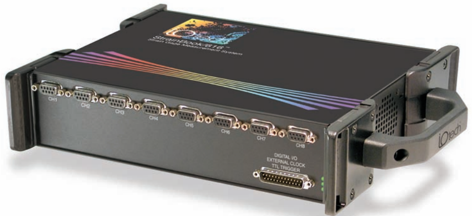
The Ethernet-based StrainBook/616 provides from 8 to 64 channels of automated bridge measurements

StrainBook/616 is a compact and portable strain gage measurement system that connects to your PC's Ethernet port. Eight channels of strain measurement are built into the StrainBook, and up to 64 channels can be measured with one StrainBook using 8-channel WBK16 options. For applications with more than 64 channels, multiple StrainBook systems can be combined and synchronized for a virtually limitless number of strain measurement channels. The StrainBook is also capable of measuring voltage, temperature, vibration, and sound using other WBK signal conditioning options.