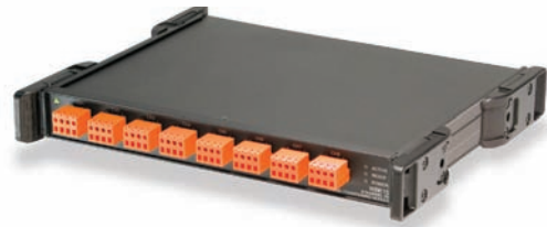
The WBK15 provides up to 8 isolated analog input channels