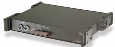
The DBK34A rechargeable lead-acid battery/UPS (uninterruptible power supply) module

The ZonicBook can be powered directly from a 10 to 30 VDC source, including a standard automotive battery, or can be powered from any 100 to 250 VAC source. For portable applications where no power is available, an optional battery pack which also serves as a UPS is available. With an 8-channel ZonicBook system, the DBK34A battery/UPS provides approximately two hours of operation.