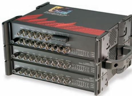
The ZonicBook expands to meet your testing needs