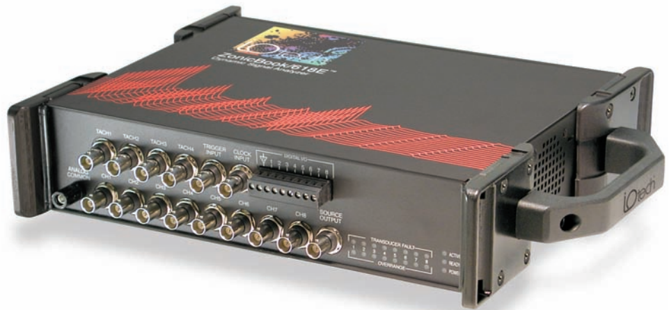
The ZonicBook/618E with eZ-Series software and your PC makes a real-time, portable vibration analysis monitoring system