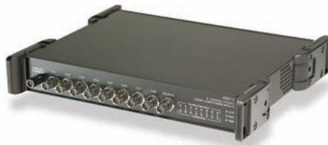
The WBK18 provides a full set of features for making dynamic signal measurements

The ZonicBook's 8 built-in channels can be expanded in 8-channel increments by attaching the WBK18 option, up to a total of 56 analog input channels. Each WBK18 adds 8 channels having the identical features as the ZonicBook's 8 built-in channels. Unlike other analyzers, expansion channels are nearly one third of the cost of the main unit, and thus a large system can be assembled with increasingly lower cost per-channel. Each WBK18 adds approximately 1.5 inches (3.81 cm) in height to the system and 1.3 kg (2.9 lbs) in weight.